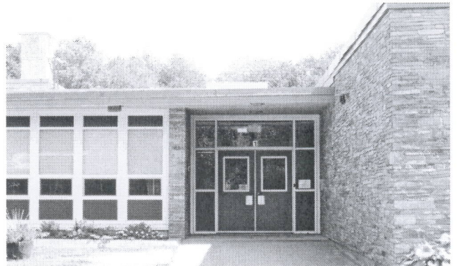
Existing Zervas ES

Wednesday, June 4, 2014 5:00 PM Newton City Hall Aldermanic Chamber