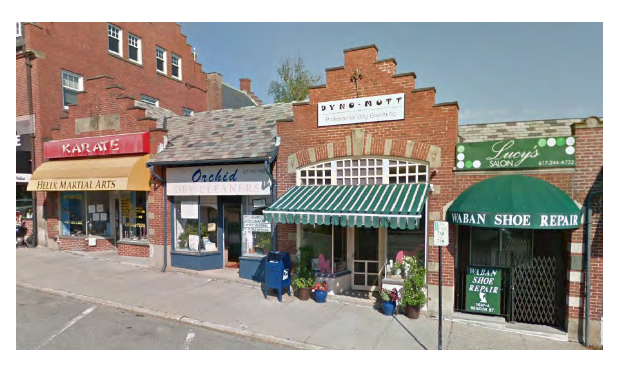
Left to right: Nos. 1639, 1637, and 1635 Beacon Street, from July 2017 Street View image. Stairs to right of No. 1635 go to Nos. 1637a and 1635a on the basement level.