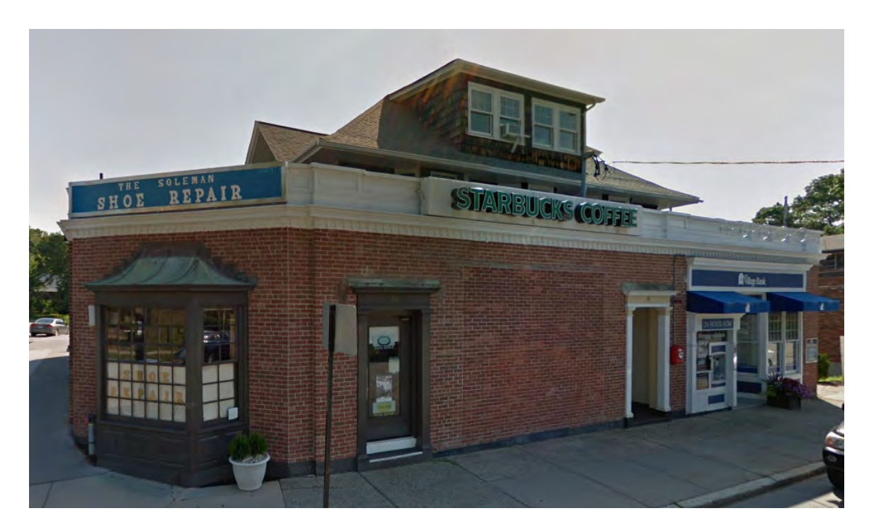
Former Waban Hall building and Wyman Street extensions. From right to left No. 89 Wyman St.; entry to stairs to upper level (No. 91); bricked-over storefront of former No. 93; No. 95. From July 2017 Street View image.