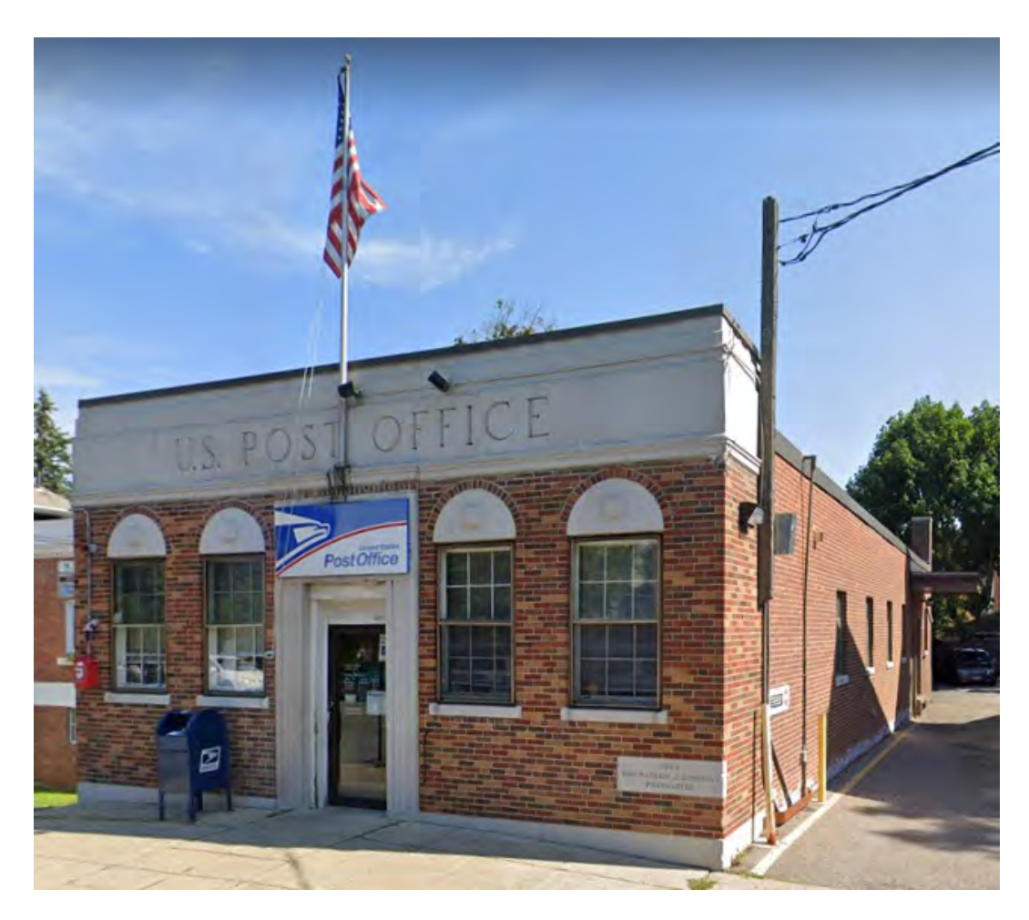
Waban Branch Post Office, 83 Wyman Street, from August 2019 Street View image.