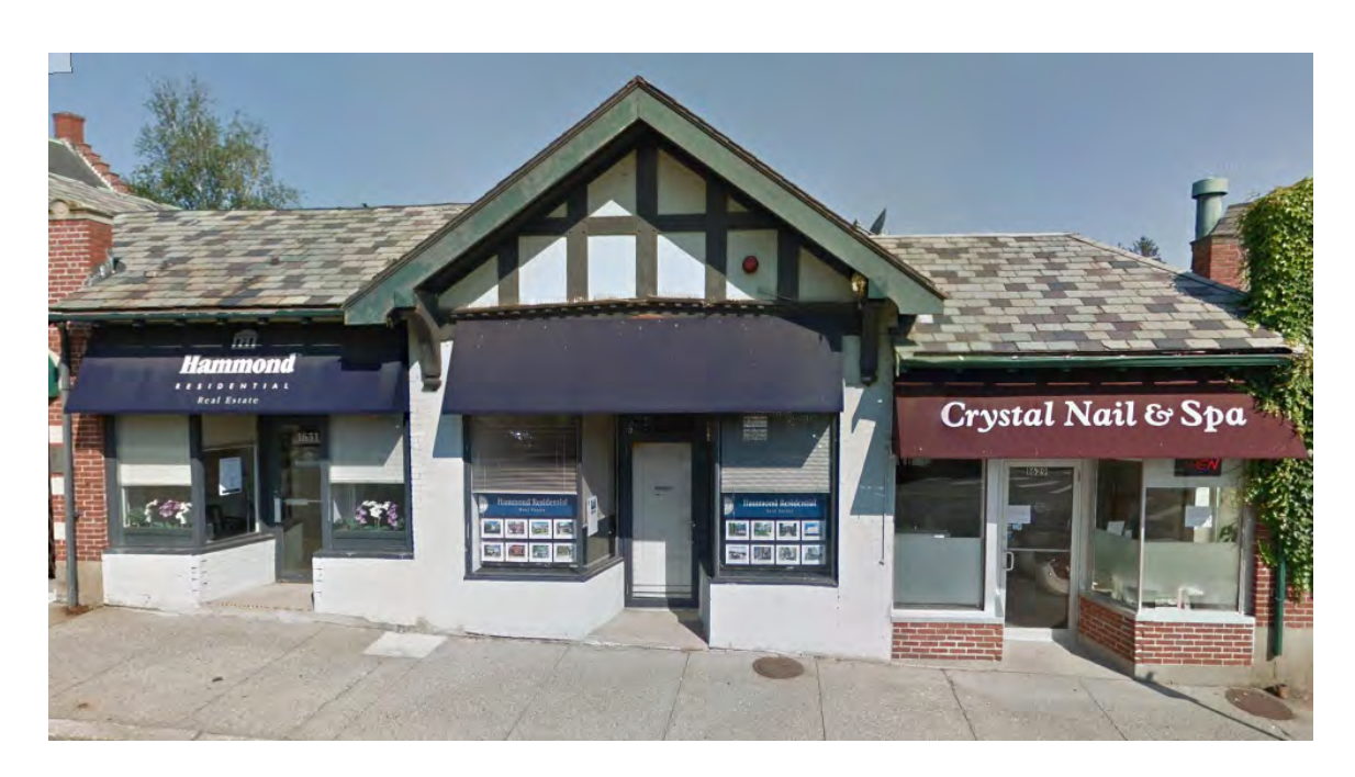
Left to right: Nos. 1633, 1631, and 1629 Beacon Street, from July 2017 Street View image.