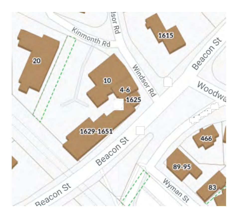
Waban Square Building Locations, from Newton Mass. GIS database