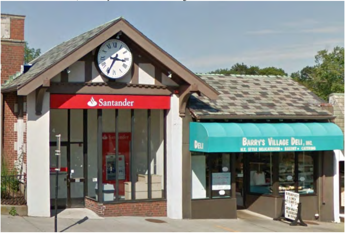
Left to right: Nos. 4 and 6 Windsor Road, from July 2017 Street View image.