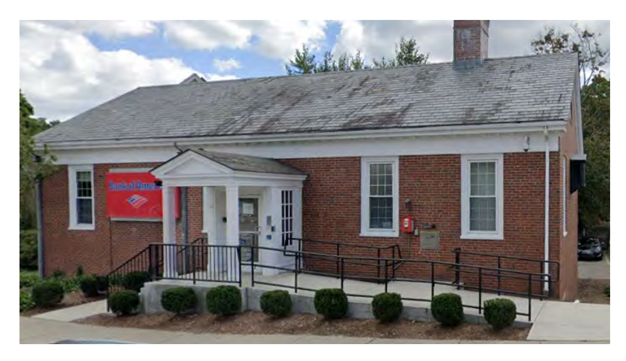
No. 466 Woodward Street, from September 2019 Street View image.