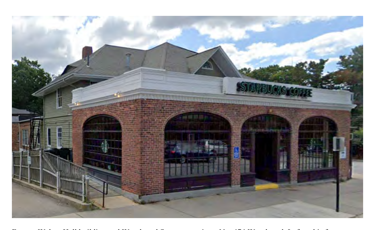
Former Waban Hall building and Woodward Street extensions, No. 474 Woodward. Left end is former No. 472 Woodward. Right end is former No. 476 Woodward. From September 2019 Street View image.